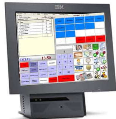
Touch Screen POS